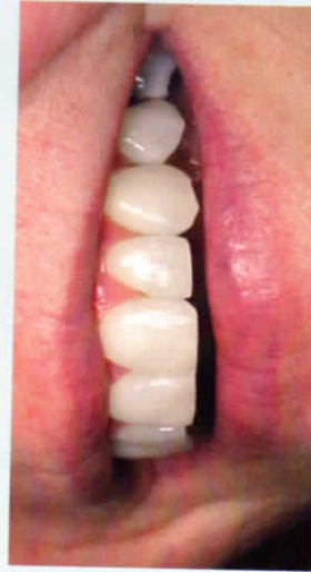
AFTER SIX MONTH SMILES®